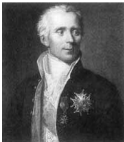
PIERRE S. LAPLACE Physics or History?

In spite of the relative failure with the fluids, a feeling of optimism invades the minds of the best mathematicians - mechanics at the end of the XVIIIth century, like Joseph Louis Lagrange 18 or Pierre Simon LAPLACE. The latter publishes his monumental book “ Mécanique céleste ” (1788). He is also the author of the “ Théorie Analytique des Probabilités ”, 1812, a most important reference in the development of probability theory 19 . Based on his mechanical studies he thought that the universe functions like a clock (determinism) and declared that the most important mathematical problems were already posed and solved, or about to be solved in a short time. Fortunately, History would prove the great man wrong on these issues. Does this bring to our minds recent heated debates about the end of