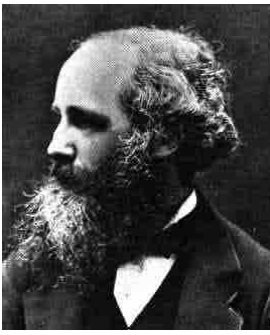
JAMES C. MAXWELL

second, the speed c that depends on the medium (and is therefore constant in the vacuum); third, the frequency \omega of oscillation, that is a variable quantity. In short,